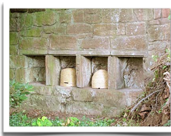
Bothwell Bee Boles

placed in bee boles, specially constructed recesses in walls, that helped to preserve the skeps and the bees inside.