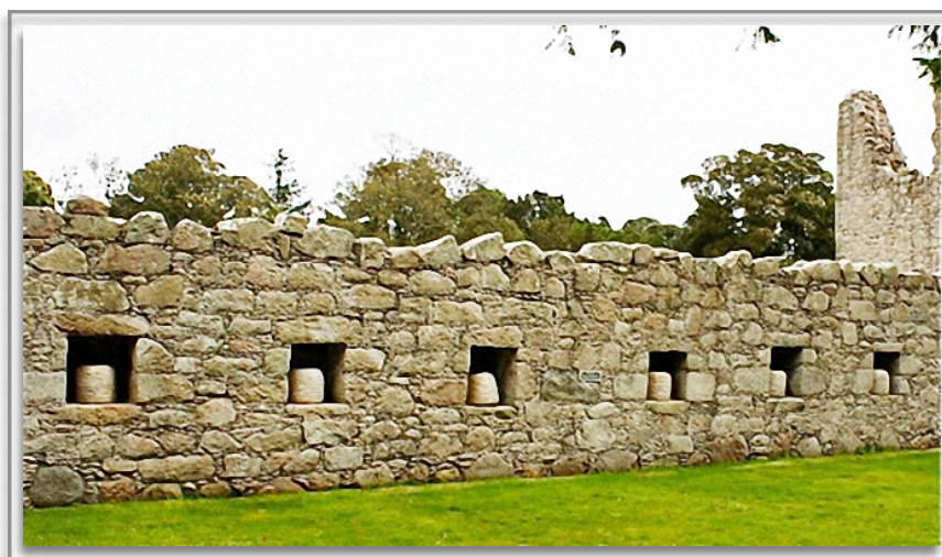
Tolquhon Castle in Aberdeenshire

Bee boles ceased to be used once wooden hives were introduced and those that survive are usually to be found in listed buildings. Nowadays they are sometimes used to hold plant containers. Some excellent examples can be seen at Brodick Castle and below, at Tolquhon Castle in Aberdeenshire.